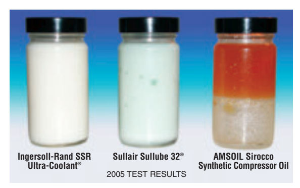
The first two oils are glycol-based and have difficulty separating from water, causing them to form damaging emulsions. AMSOIL SIROCCO quickly separates from water, increasing compressor protection.

AMSOIL SIROCCO Synthetic Compressor Oil is a multi-viscosity oil meeting the requirements of 5W-20. It eliminates the need for multiple compressor oils and may be used in applications calling for either an ISO-32 or ISO-46 viscosity compressor oil or coolant. It is recommended for use in single and multi-stage rotary screw compressors and vacuum pumps calling for these viscosities.